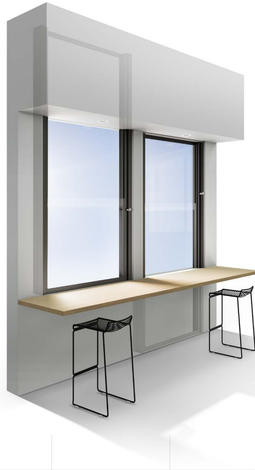
Into cavity top.