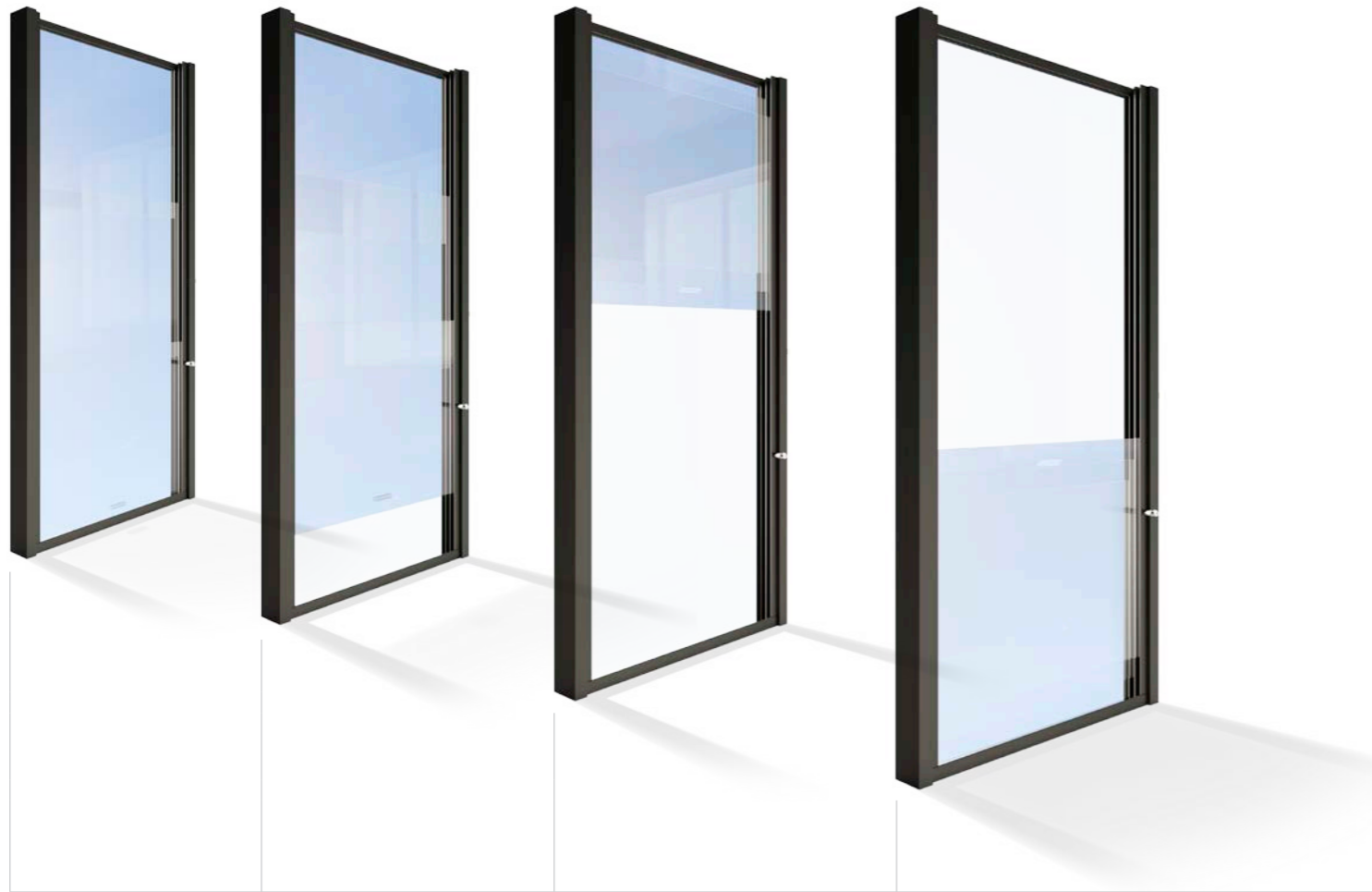
Closed panes for an uninterrupted view.

Three pane Flomotion provides the largest opening of any sashless window.