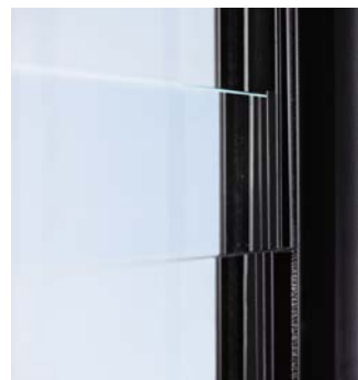
Traditional sashless window with single sheet of glass and overlapping panes when the window is in the closed position.