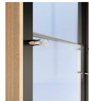
Lock the window in either the open or closed positions by key or use the twist to lock and release feature.