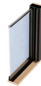
Single glazed with clear lap seal.