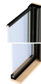
Double glazed option with meeting rail.