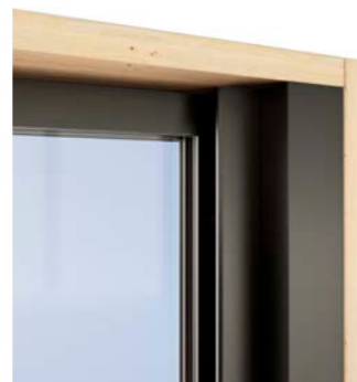
Streamlined box profile, conceals the mechanism which control the movement of the glass.